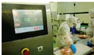
The X-rays scanning

Plenus Foods Co., Ltd. polishes brown rice and processes various foods to Plenus group companies. The rice milling center, called “Seimai Center”, mills rice systematically and supplies to our group stores the just-milled, healthy, and delicious rice called “Kinme Rice.” The meat processing plant developed Japan's first continuous defrosting machine, which enables to defrost the frozen raw materials in one hour with low temperature steam. Moreover, both of the two facilities are located next to Plenus central distribution center, which leads to minimize the loss of time and construct an efficient delivery system supplying fresh food products to our group stores.