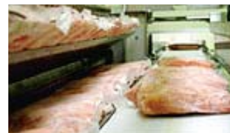
Continuation-style defrosting machine