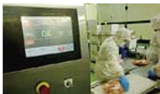
The X-rays scanning

Plenus Foods Co., Ltd. polishes brown rice and processes various foods to Plenus group companies. The rice milling center, called “Seimai Center”, mills rice systematically and supplies to our group stores the just-milled, healthy, and delicious rice called “Kinme Rice.” The meat processing plant developed Japan's first continuous defrosting machine, which enables to defrost the frozen raw materials in one hour with low temperature steam. Moreover, both of the two facilities are located next to Plenus central distribution center, which leads to minimize the loss of time and construct an efficient delivery system supplying fresh food products to our group stores.