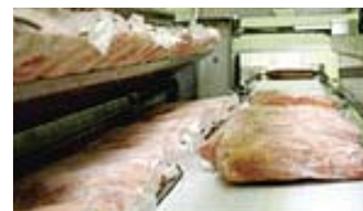
Continuation-style defrosting machine