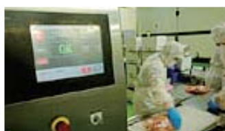
The X-rays investigation

Certified according to ISO 9001, Plenus Foods Co., LTD. supplies various food items to PLENUS group companies. In order to achieve the best production environment, the processing plant has been designed to be hygiene district structure with stainless steel walls. In addition, to achieve high productivity and production, it developed Japan’s first continuous defrosting machine, which enables to defrost the frozen raw materials in one hour with low temperature steam. Moreover, siting it attached to the PLENUS central distribution center, PLENUS group successfully minimize the loss of time and possibility of accidents in distribution.