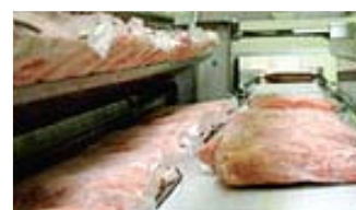
Continuation-style defrosting machine